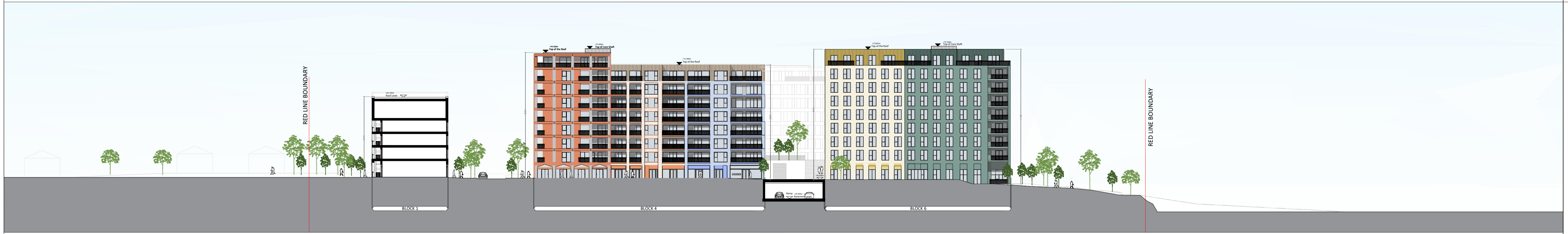
Site Section E-E 1:500@A1