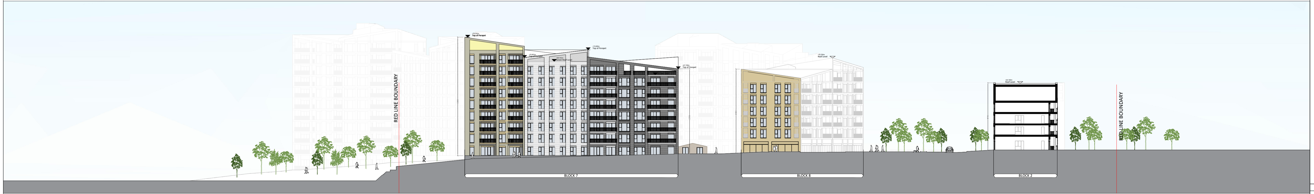
Site Section F-F 1:500@A1